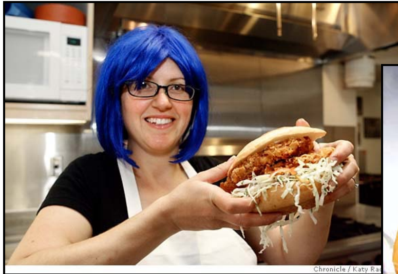
Chronicle / Katy Ra