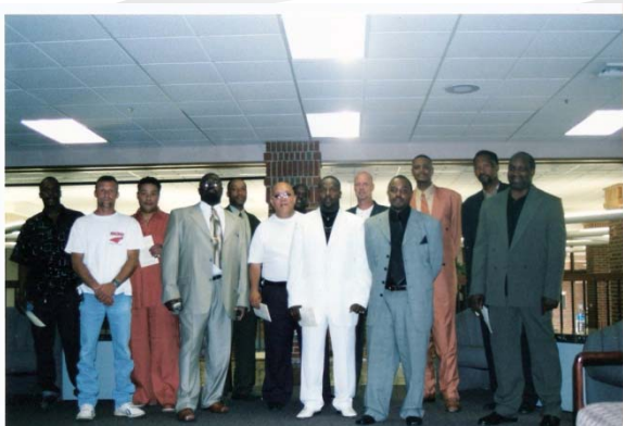
Aftercare Graduation 2005