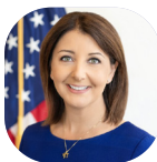
Mandy Cohen, MD, MPH Director Centers for Disease Control and Prevention