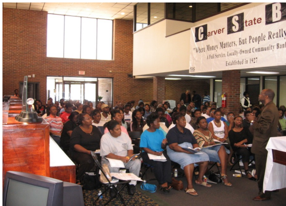
Potential first time homeowners attend Homebuyers Education Workshop at Carver State Bank

Locations to be announced! Call to reserve your space!