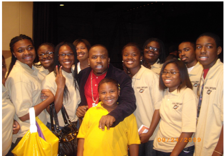
The Wall Street Club along with Antwan "Big Boi" Patten at the Youth Futures Authority Annual Summit